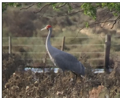
Broilga in Wanganella Swamp

This is the first watering event in the YCS this year and we pleased to get water into the system, no matter what the timing, as it will highlight what our system has to offer birdlife, aquatic and wetland species. Wanganella Swamp is an excellent drought refuge and one we want to keep alive.