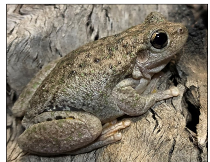
Peron's Tree Frog

The Peron's Tree Frog hides in the bark of redgums and like to sit up on trees and logs to call. They have a maniacal cackle